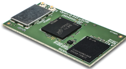
Open-Q™ 845 μSOM