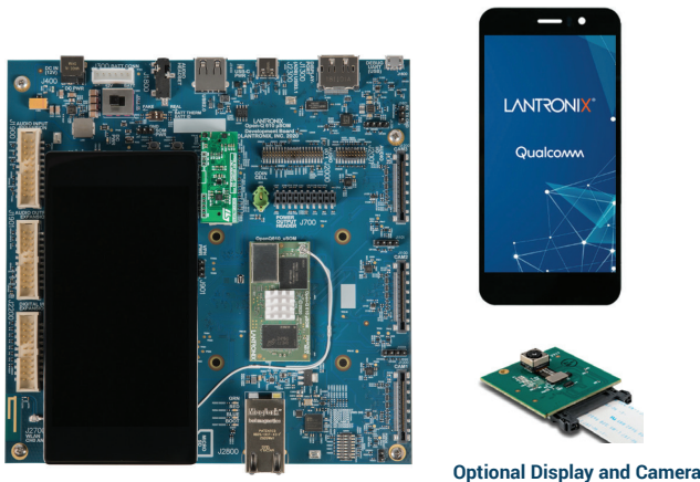
Optional Display and Camera

Development Kit includes: Carrier board, 610 μSOM (2+16GB), ST Micro sensor board, 12V power supply, Quick Start Guide, access to full documentation, SW updates, and basic development kit support.