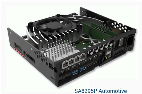
SA8295P Automotive Development Platform with Thermal Enclosure Configuration