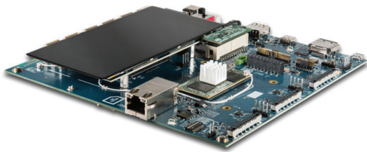
Companion Development Kit available separately