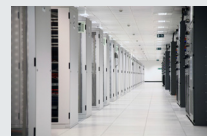
Hyperscalers & Data Centers