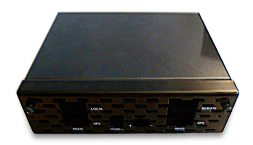
Below Deck Unit (BDU)