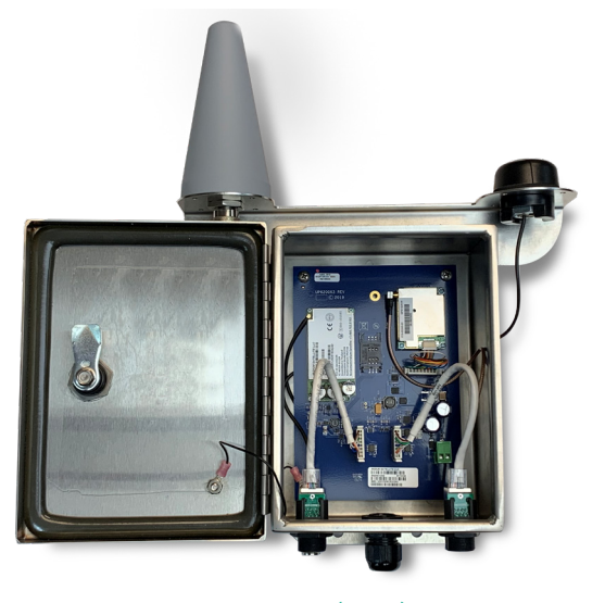
Above Deck Unit (ADU)