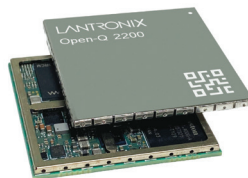
Open-Q 2200 SIP Family