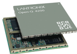
Open-Q 4200 SIP Family