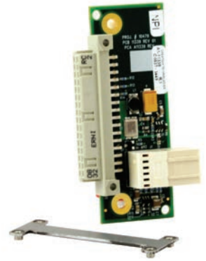
ION Adapter Card

Management modules from both the ION Platform and the Point System™ allow users the ability to re-deploy and fully manage their Point System™ devices, optimizing their current equipment and easing their migration to the ION Platform. Full read/write management of Point System™ modules is also available in the ION chassis through the use of a Point System™ Management Module along with the ION adapter card.