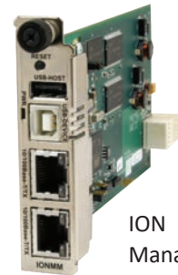
ION Management Module