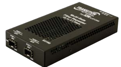
1 Gbps to 11.5 Gbps Fiber SFP to Fiber SFP Stand-Alone Media Converter