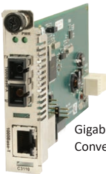
Gigabit Ethernet Media Converter Module