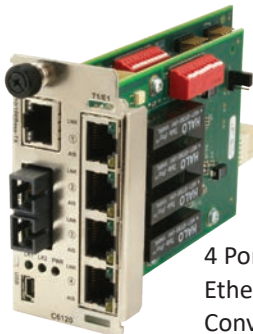
4 Port T1/E1 Plus Ethernet Media Converter Module