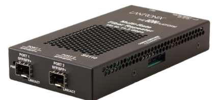
to Fiber SFP Stand-Alone Media Converter