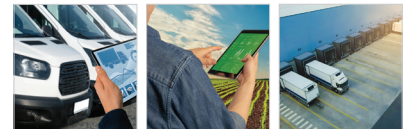
Asset & Workforce Tracking