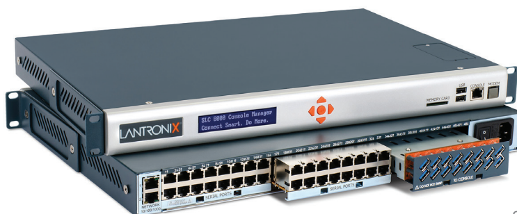
SLC™ 8000 Console Manager

All modern data centers are constructed with a high regard for physical security and efficiency. Nevertheless, there is an ongoing cost to the operation for each visitor entering the site: this expense can be mitigated by using secure remote access solutions from Lantronix providing benefits for data center operators and customers alike. One should consider Lantronix out-of-band Remote Environment Management products in these situations.