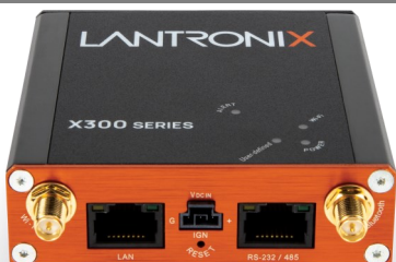
Model shown: X300F202S