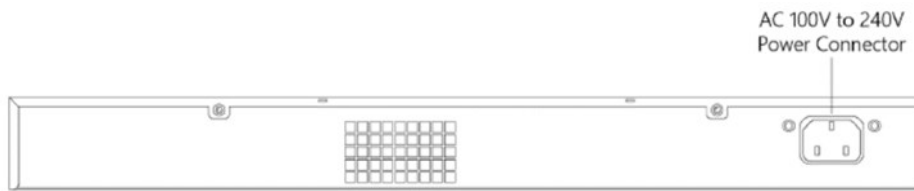
SM24TBT4XPA Back Panel