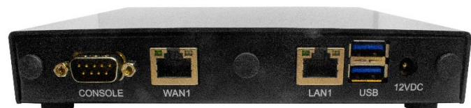
SRA-RAD Back Panel

CONSOLE: DB-9 connector for Command Line Interface (CLI) operation.