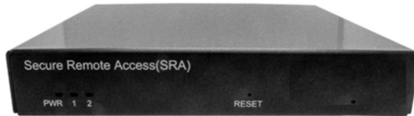
Front Panel (RAD and MAP)

The front panel has three green LEDs (labeled PWR, 1, and 2) and a RESET button (not used).