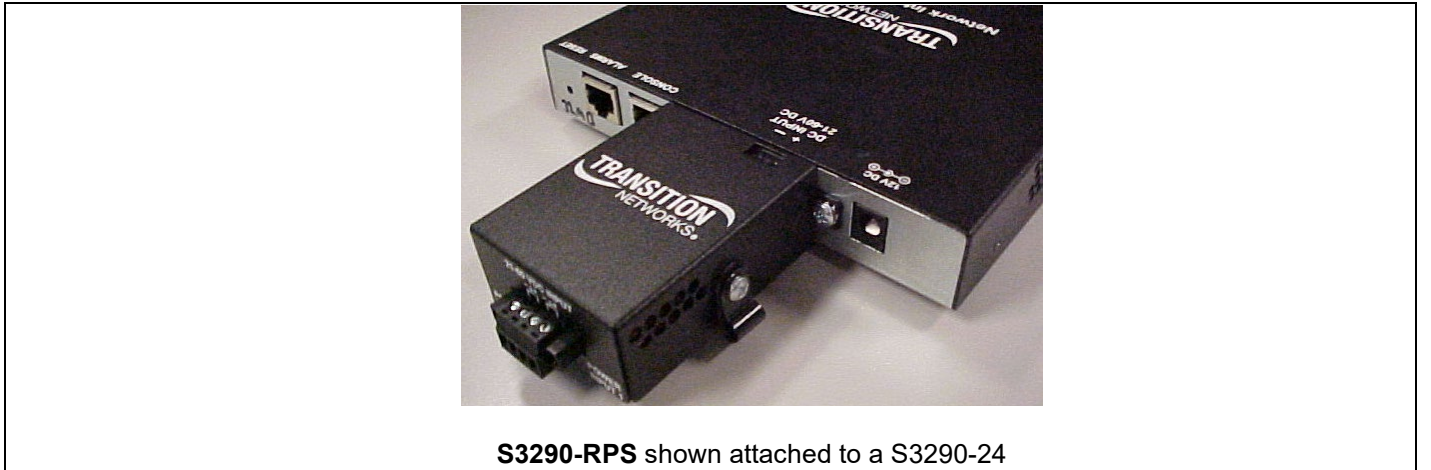
S3290-RPS shown attached to a S3290-24