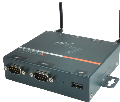
Mounting Bracket (one on each side)

Slide the SIM holder to the lock position (in direction of the LOCK arrow). Replace the cover.