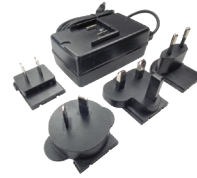
Power Supply (Actual power supply may differ from that depicted here.)