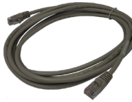
RJ-45 Ethernet Straight Cat5 Cable