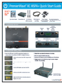
Quick Start Guide